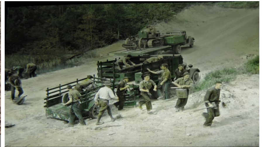
Exhibit 3 – CCC and CCC Indian Division