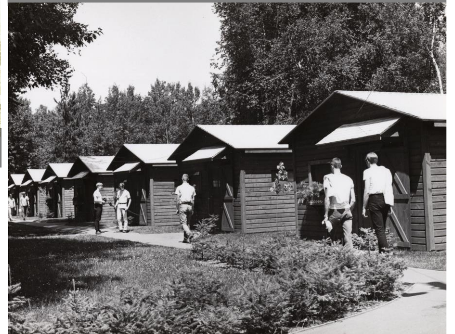
Exhibit 4 – Youth Conservation Corps