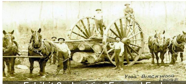
Exhibit 2 – Logging Era and Early Management