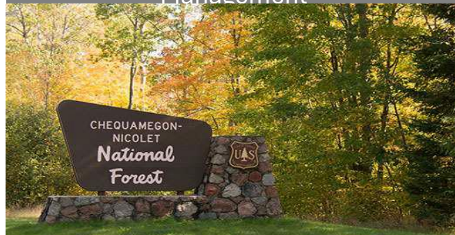
Exhibit 5 – Modern Scientific Management of Forests