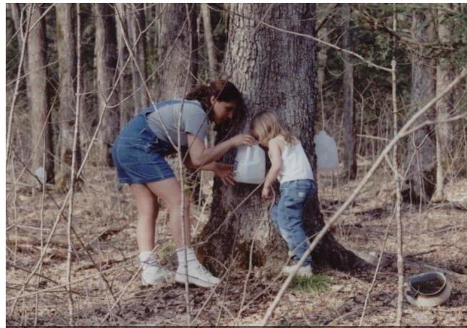
Exhibit 1 – Indigenous Nations