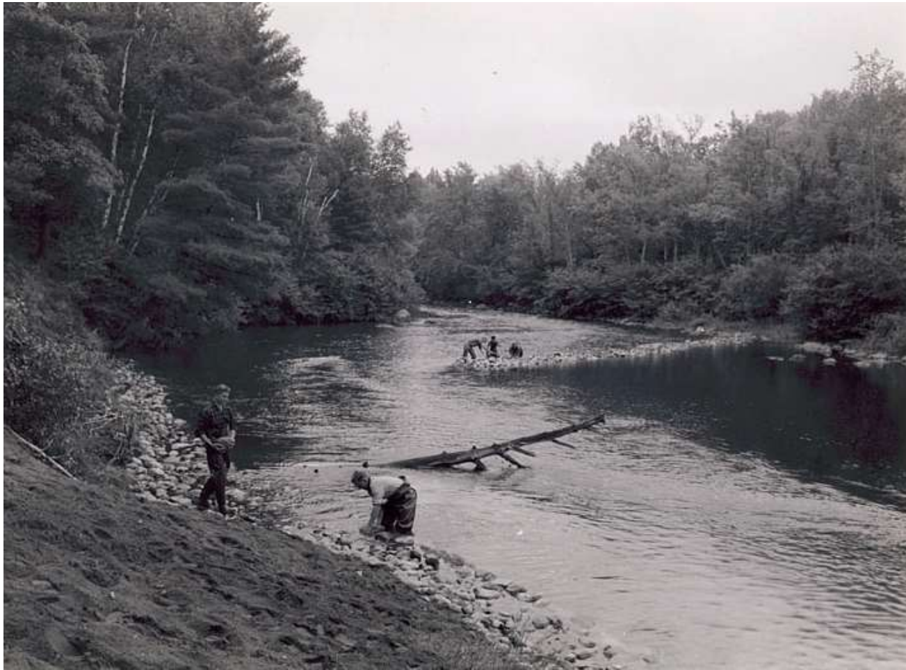
(e) Operation Wing Dam. —A 1-mile length of the Manitowish River immediately south of U.S. Highway No. 51 in Vilas County was reconstructed for fish habitat improvement. Three separate rock deflector devices were built, each exceeding 100 feet in length. Stones were rooted from the river bottom.