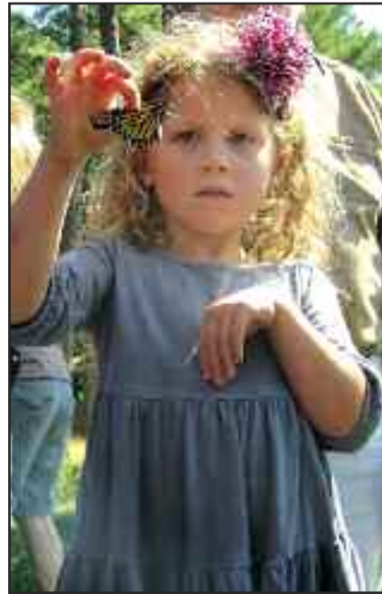
Many young people make their first connections to nature at the Discovery Center...and we want to do more.

Today the Discovery Center finds itself at the intersection of a need and opportunity to do more and the inability to do it, primarily because of our physical plant.