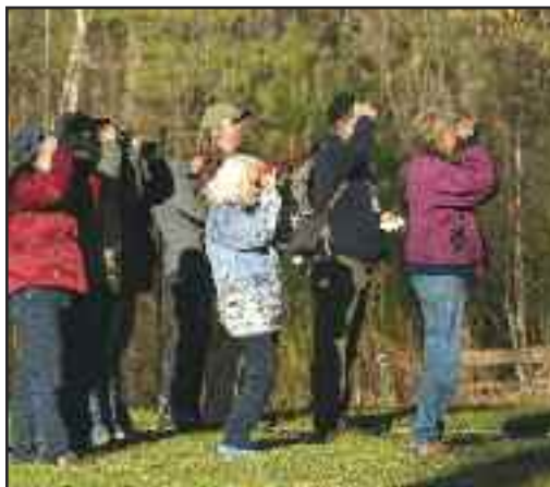
Please join us. The greater our numbers, the clearer our vision becomes.

A: Three reasons: First, many of our supporters love the "old" Lodge and the history it represents and have encouraged us to keep it central to the Discovery Center's future. Second, with the help of our architect and construction experts, we have determined that winterization of the Lodge is quite feasible and economic. And third, because we have scaled back the total size of our campaign, we must also reduce the scope of construction.