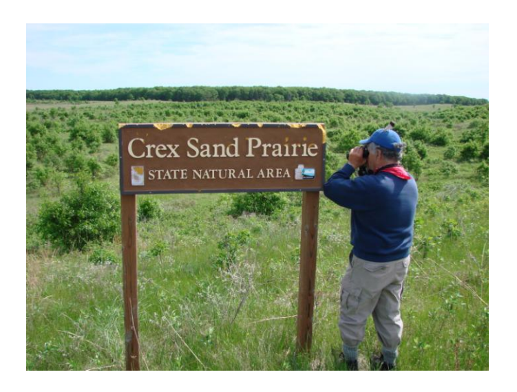
Jon Cassady studies the Crex Meadows landscape*

Two hundred and seventy species of birds use the property along with nearly every mammal found in Wisconsin and a good variety of reptiles, amphibians, and invertebrates. One of the highlights of Crex is the number of endangered and threatened species. Crex has breeding populations of osprey, eagles, trumpeter swans, Karner blue butterflies, Bandings turtles, and Red-necked Grebes.