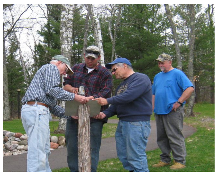
The bird-sign installers at work*

The Bird Club is now at work developing a descriptive brochure which will orient hikers to the locations and content of the signs.