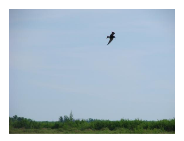
Black Tern at Crex Meadows*

A number of birds were recorded that may represent the only opportunity for the club to observe them during 2011. Included were Northern Shoveler, Ring-necked Pheasant, Red-necked Grebe, Caspian Tern, Black-billed Cuckoo, Whip-poor-will, Yellow-throated Vireo, Purple Martin, Brown Thrasher, Golden-winged Warbler, Eastern Towhee, Field Sparrow, and Vesper Sparrow.