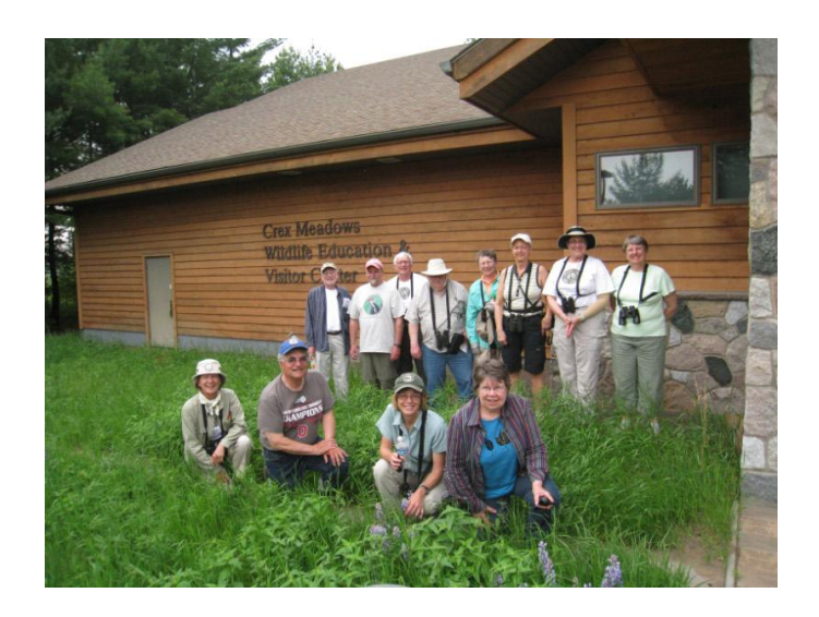
The Bird Club at Crex Meadows

Two hundred and seventy species of birds use the property along with nearly every mammal found in Wisconsin and a good variety of reptiles, amphibians, and invertebrates. One of the highlights of Crex is the number of endangered and threatened species. Crex has breeding populations of osprey, eagles, trumpeter swans, Karner blue butterflies, Bandings turtles, and Red-necked Grebes.