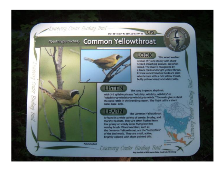
Common Yellowthroat Sign on NLDC Trail*

between Bird Club members and NLDC staff to design, produce and emplace the signs.