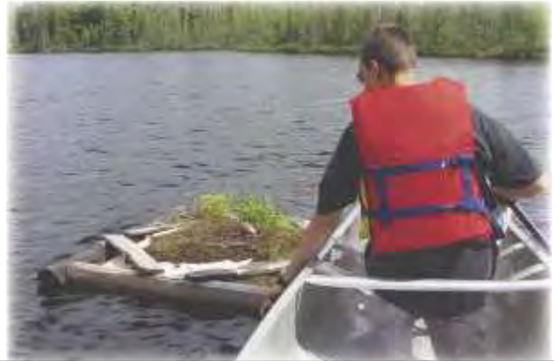
Mercer and Hurley students work with NLDC naturalists to place loon platforms, intended to encourage and improve nesting success.

For the past twenty years, the Wisconsin DNR has been conducting research on the impact of mercury on loon populations in the northeastern part of the state. This work has explored the potential causes of loon productivity decline on Iron, Vilas, Oneida and Forest county lakes. Results of this study are pending; however initial findings suggest that loons nesting on high mercury, low pH lakes have reduced chick production and survival. In addition, the study identifies habitat type as a factor connected to loon populations. The results show that loons living on small lakes