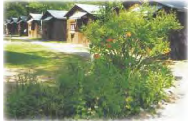
Our newly renovated cabins and main lodge offer clean, comfortable accommodations for camps, reunions, conference groups, and more. Our facilities are able to house groups of up to 100.

Thanks to major donor contributions, the Discovery Center's "maturing" facilities have been renovated and refurbished over the last two years. This winter's primary project was to upgrade our cabins. The eight bunkhouses are now drywalled, insulated, carpeted, and will soon sport spiffy new blinds. Our three teaching cabins are receiving new closets and cabinetry to make them more efficient and useable.